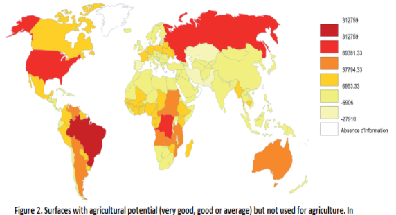
Figure 2. Surfaces with agricultural potential (very good, good or average) but not used for agriculture. In thousands of hectares per country. Made by AGTER from 2002 GAEZ / IIASA-FAO data. (map made using Philcarto)

G. Chouquer and other researchers have shown that analysis of satellite images without verification in the field or analysis at a more local scale have often led to mistaken interpretations. By zooming in on an area that seems empty, we can discover fields and the various land-use forms that show that people live there [Chouquer, 2012, p 91-93].